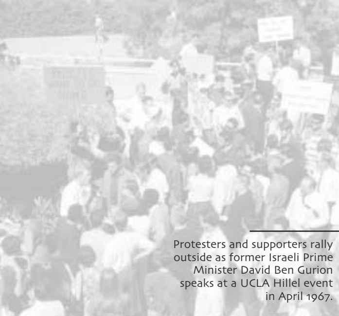
Protesters and supporters rally outside as former Israeli Prime Minister David Ben Gurion speaks at a UCLA Hillel event in April 1967.