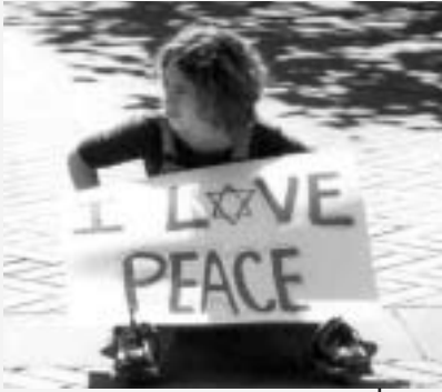
University of California Berkeley, 2002.

In 2002, Hillel organized its Center for Israel Affairs with the Jewish Agency for Israel. Hillel provided campuses with grants to organize events; created a speakers' bureau that sent Middle East experts to campuses across North America; and is supporting 40 Grinspoon Israel advocacy interns on campuses around the country. In July, Hillel and the Charles and Lynn Schusterman Family Foundation launched the Israel on Campus Coalition to coordinate pro-Israel advocacy among 25 Jewish groups.