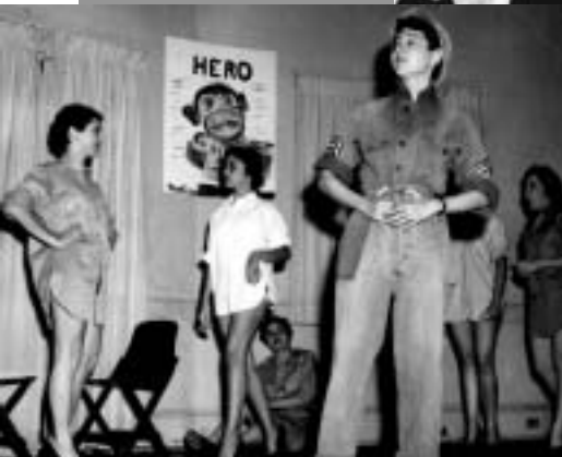
University of Alabama Hillel students present Talent Night, 1954.