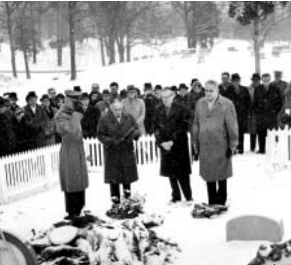
In December 1963, Hillel staff participating in the annual Directors Meeting pay tribute to President John F. Kennedy at Arlington National Cemetery