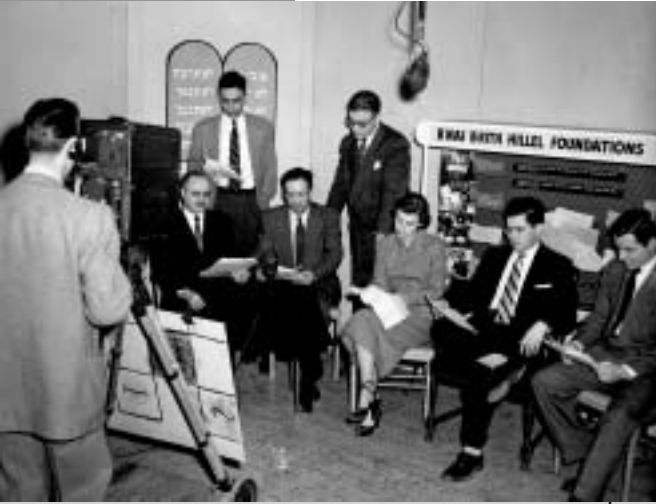
George Washington University Hillel students perform "Purim Goes to College" on WTTG television in 1952.