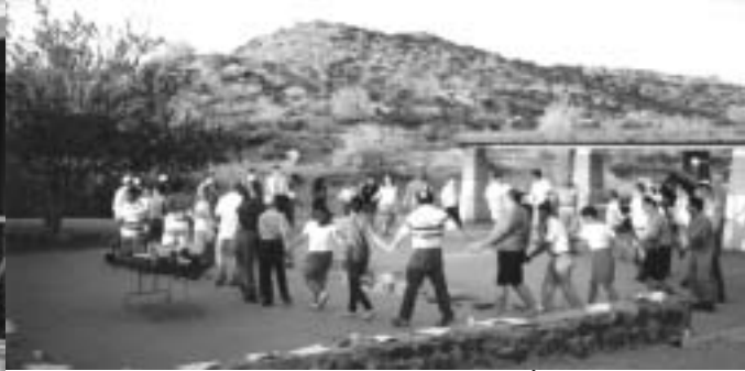
Arizona State University Hillel students celebrate Passover.