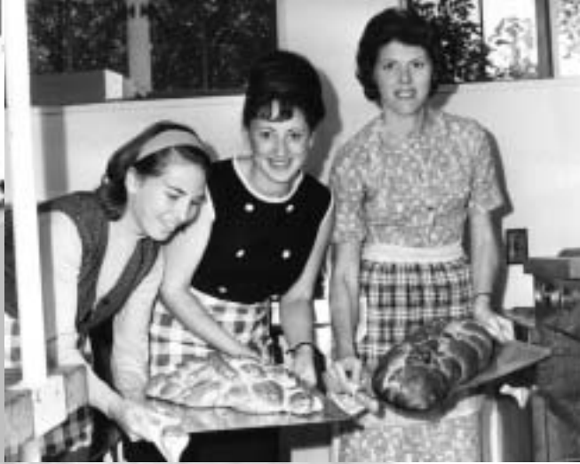
Purdue Hillel teaches women the art of baking challah for the High Holy Days in 1965.