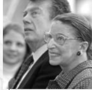
Hillel International Board of Governors Chairman Edgar M. Bronfman and Supreme Court Justice Ruth Bader Ginsburg at the dedication.