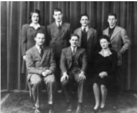
The student executive board of Hillel at Queen's University, 1942-1943, the first in Canada.