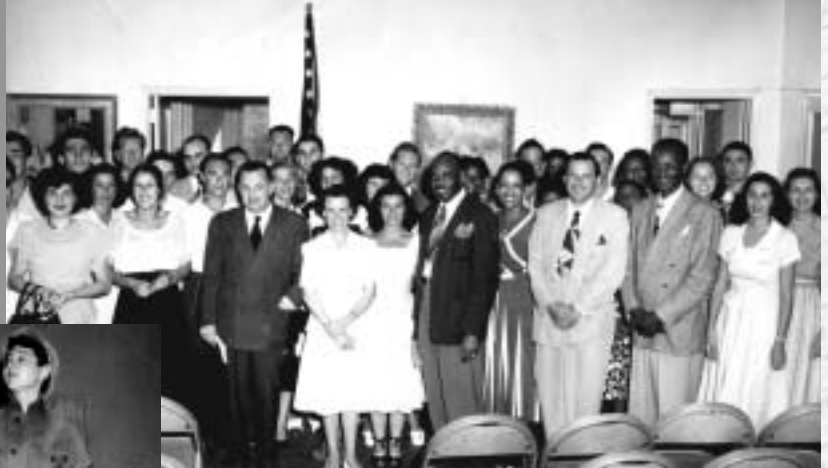
Before the Civil Rights movement began, Hillel professionals hosted an "Inter Racial Conference" at the Southeastern Hillel Conference, 1948.