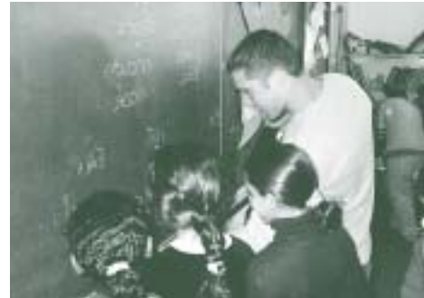
A University of Illinois Hillel student teaches in the Israeli town of Kiryat Gat during a birthright israel trip.

Hillel students from across North America rally in front of Jerusalem's City Hall during the May 2002 Israel Advocacy Mission.