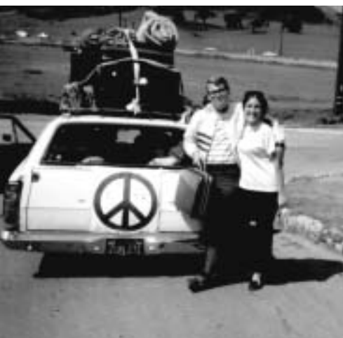
Hillel activists take "Shalom" on the road after a regional conference in March 1970.

Everything began to change. Hillel bolstered student, professional and lay leaders by providing them with training and encouraging them to take ownership of the organization locally and internationally. Hillel established a process of accreditation to provide universal standards of excellence throughout the system. A new Hillel logo was created that formed the Hebrew letters for Hillel into a dynamic flame. And to underscore a desire to engage all Jews on campus and beyond, Hillel adopted a new mission statement: "Maximizing the number of Jews doing Jewish with other Jews."