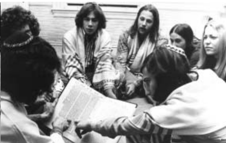
Students study a portion of the Talmud following Shabbat services in the early 1970s.