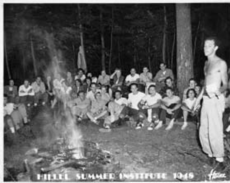
Hillel's third Summer Institute in 1948 brings together Hillel students and professionals.