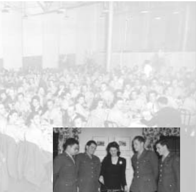
Hillel sponsors a Seder for military trainees at College Station, Texas in 1945 (background) and sends them off to war from Indiana University.