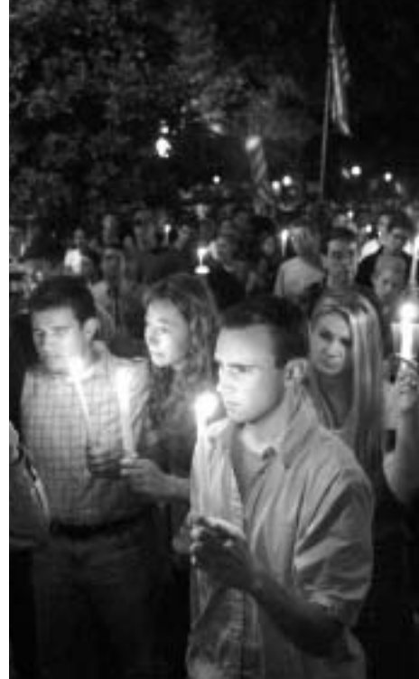
University of Michigan Hillel helps to organize the campus-wide vigil following the attacks of September 11, 2001.

Hillel students are also taking a more active role in advocating for Israel. Israel has always been at the heart of Hillel's work. Hillel supports Israel's right to thrive as a Jewish state within recognized and secure borders. Hillels organize Israel-oriented activities on campus: everything from lectures, to concerts, to Yom Haatzmaut celebrations.