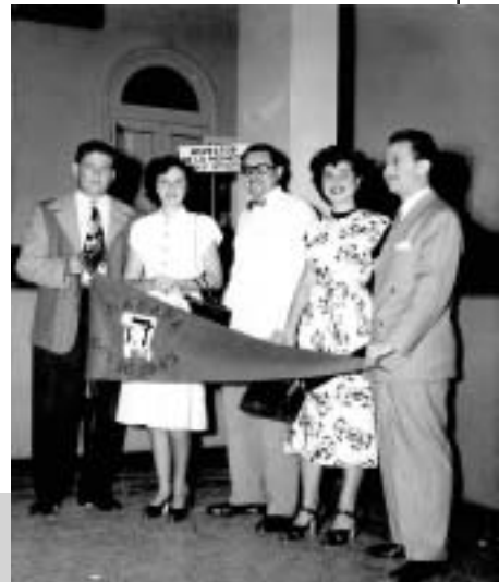
Havana Hillel, founded in 1945, sends delegates to the Southeastern Hillel Convention in Florida in 1948.