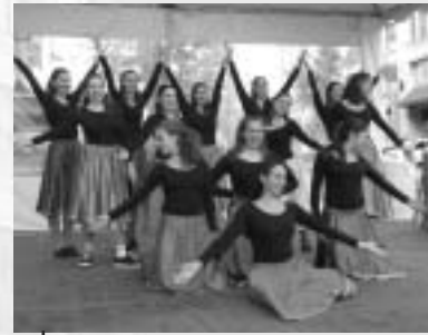
B'Yachad, the Brandeis Hillel Israeli Folk Troupe, performs at the dedication.